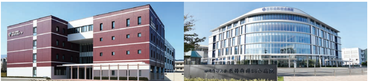
Fukuoka Nursing College