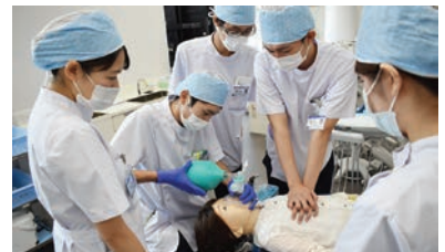
The educational institution Fukuoka Gakuen is made up of Fukuoka Dental College, Fukuoka Nursing College and Fukuoka College of Health Sciences, all of which collaborate closely to provide excellent education and pioneering research.