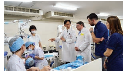
Faculty and students of Fukuoka Dental College and their international partners benefit mutually from their exchange programs.